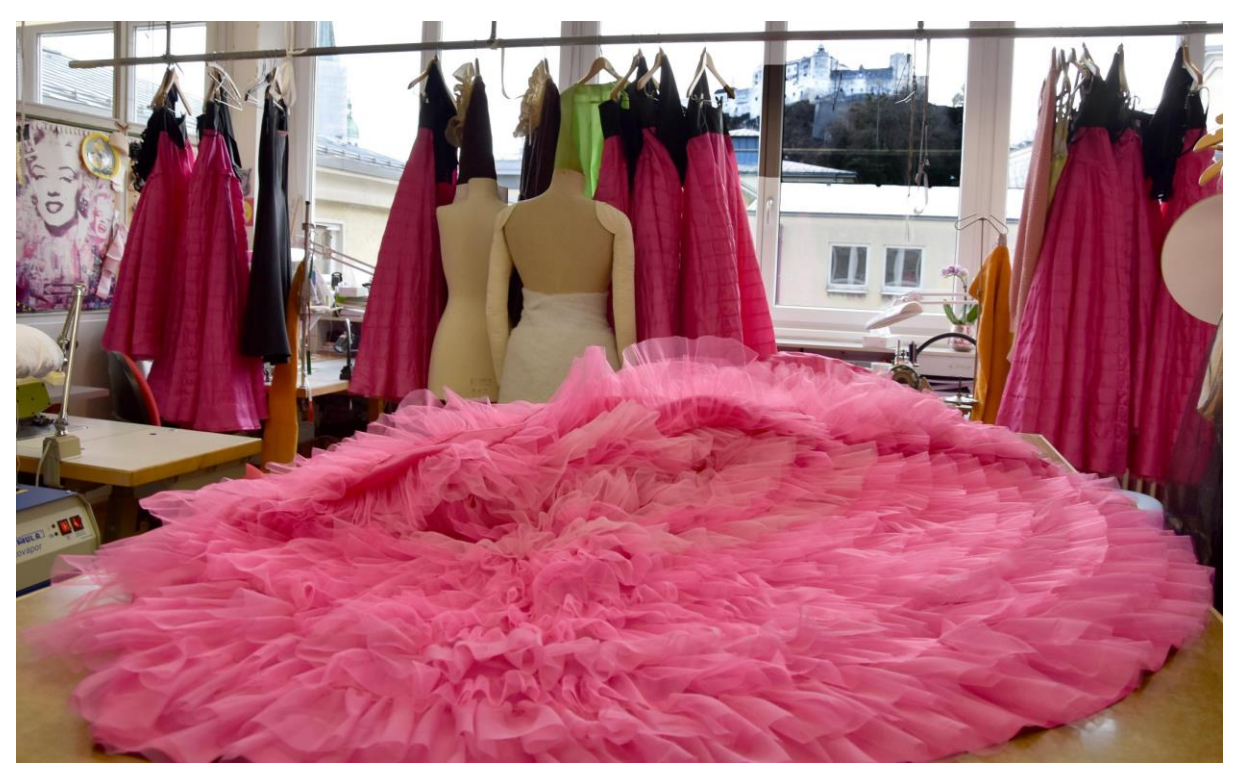
Speaking of the can-can: detail from the Salzburg Festival costume department

It was a mixture of political satire, porn and varieté. So we can't even begin to imagine what it was actually like. All we know is it was very hot in those tiny theatres, which must have been part of the experience: sweaty and dirty.