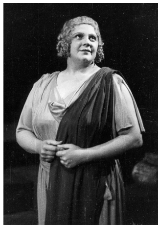
Hilde Konetzni, 1937