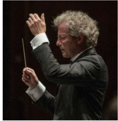
Franz Welser-Möst