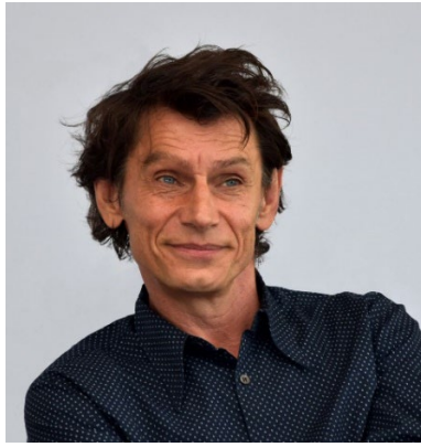
Krzysztof Warlikowski