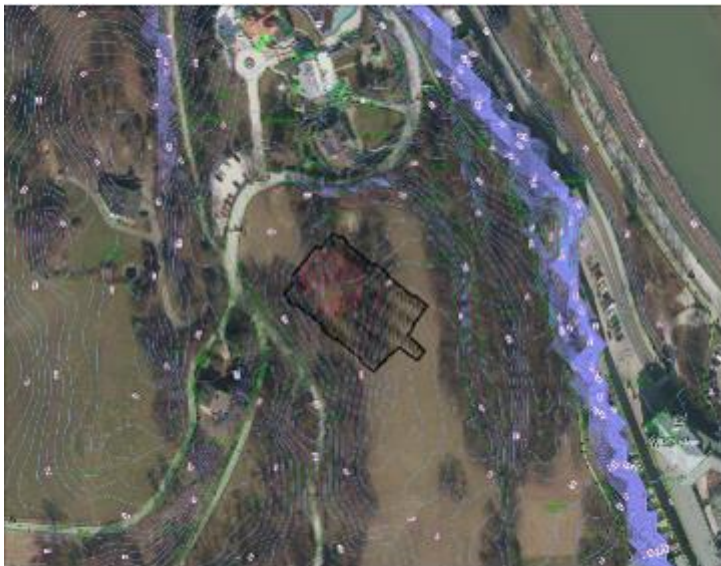
The Mozart-Festspielhaus project on Mönchsberg in 1890 (Atelier Fellner & Helmer, Vienna) for 1500 persons was to be located on the meadow between today’s Museum der Moderne and today’s Schlosshotel Mönchstein. (The entire stage area is cross-hatched in red.)

People’s interest for the idea of the festival theatre on Mönchsberg is to be aroused in passing. An abandoned idea becomes an object of art, and the three-part sculpture transforms the vision, bringing it into the centenary year of 2020.