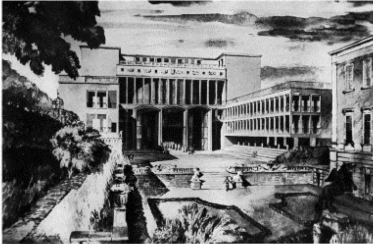
96 Projekt eines neuen Festspielhauses für Salzburg: Bühnenanlage mit offener Bühne gegen den Mirabellgarten Project of a new Festival Theatre at Salzburg: Back stage with stage opening onto the Mirabell Garden

Using the glass back wall of the stage, Clemens Holzmeister focused on the Castle Hohensalzburg in his project for the Musical Olympic Games (1950/51). Together with the lower wings, the dominant stage tower forms an “open air stage” extending the stage toward Mirabellgarten.