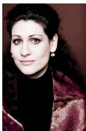
Anja Harteros