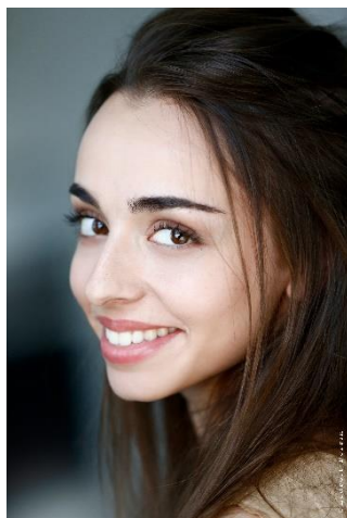
Lea Desandre