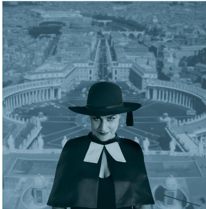
Cecilia Bartoli

Listen to Cecilia Bartoli sing “Lascia la spina, cogli la rosa” from G. F. Handel’s Il trionfo del Tempo e del Disinganno https://www.salzburgerfestspiele.at/presse/audio