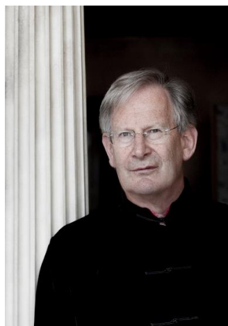
John Eliot Gardiner