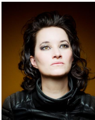
Anna Prohaska