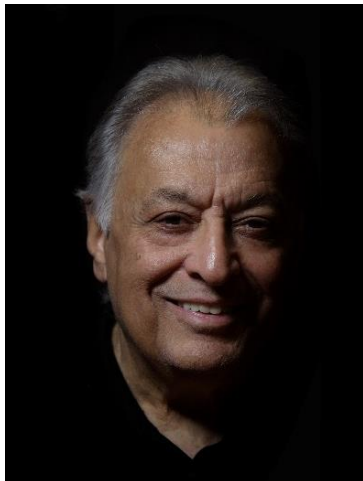
Zubin Mehta