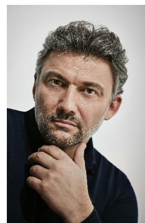
Jonas Kaufmann