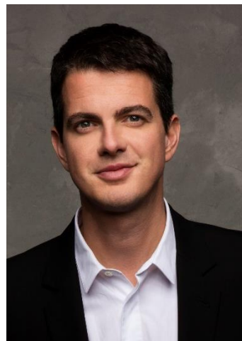
Philippe Jaroussky

Puccini's Tosca is linked to Rome like few other operas. You will be singing the role of the Pastorello, which you first performed at the Opera in Rome when you were ten. How do you remember that performance, and how does it feel to once again take on this role?