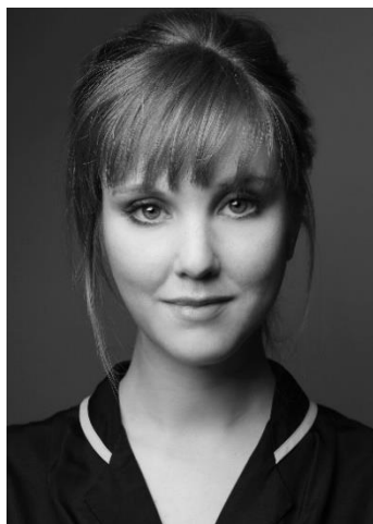
Mélissa Petit © Swan Photographies