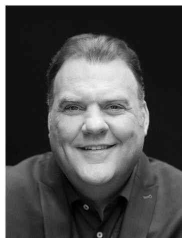
Bryn Terfel