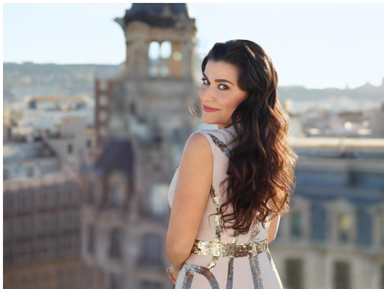
Cecilia Bartoli

I would like to pay homage to Rome, my beloved hometown. For 150 years Rome has been the capital of modern Italy and has retained its contradictory identities, of proud splendour on the one hand and decadence and decay on the other. Through all times, the city has remained true to its trademark, losing none of its potency and allure as the Eternal City.