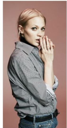
Mavie Hörbiger Teufel © Irina Gavrich