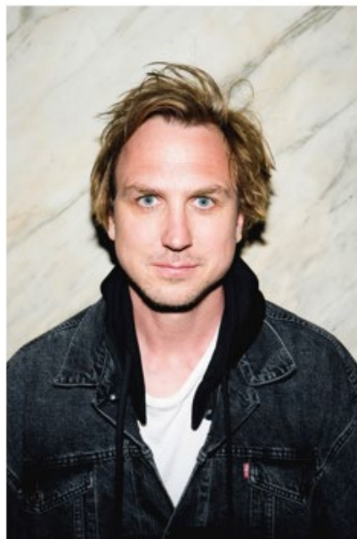
Lars Eidinger Jedermann