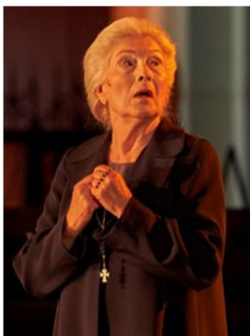
Edith Clever Tod