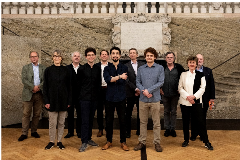
The three finalists of the 2021 Herbert von Karajan Young Conductors Award with the jury members and Festival President Helga Rabl-Stadler.