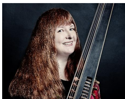
Christina Pluhar