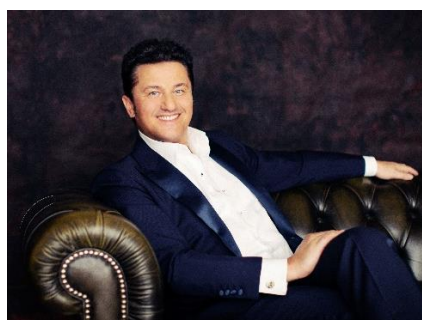
Piotr Beczala