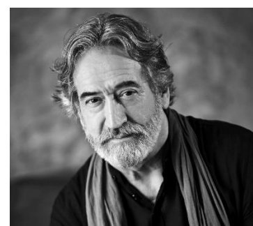
Jordi Savall