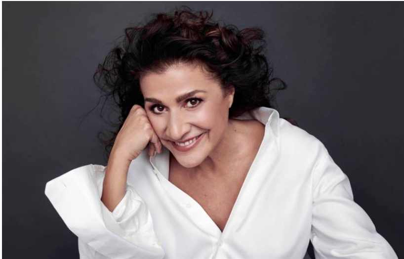
Cecilia Bartoli

international career, and I'm so happy to return to it — maybe for the last time — alongside some of my very favourite colleagues, with Gianluca Capuano conducting and a new staging by Rolando Villazón,” says the Artistic Director of the Salzburg Whitsun Festival, Cecilia Bartoli.