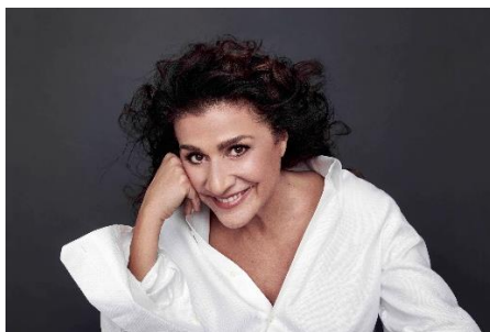
Cecilia Bartoli