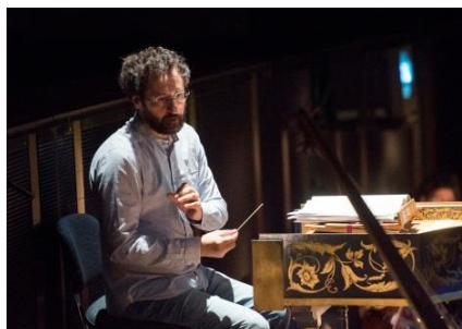
Gianluca Capuano © SF / Monika Rittershaus

http://www.salzburgerfestspiele.at/fotoservice