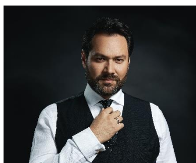
Ildar Abdrazakov © Anton Welt