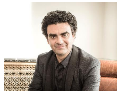
Rolando Villazón