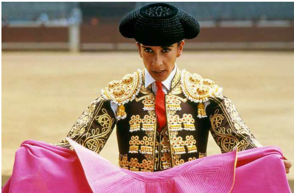
Film still from: Pedro Almodóvar, Hable con ella (Talk to her), 2002, Allstar Picture Library Ltd. / Alamy Stock Foto. © El Deseo S.A., Madrid