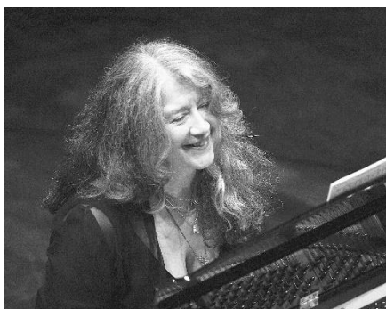
Martha Argerich