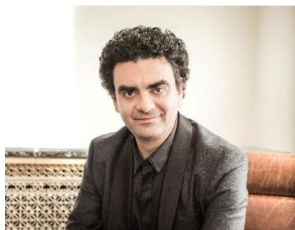
Rolando Villazón