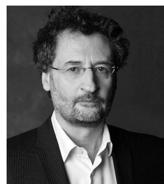
Gianluca Capuano