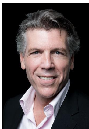
Thomas Hampson