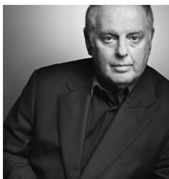
Daniel Barenboim

https://www.salzburgerfestspiele.at/presse#fotoservice