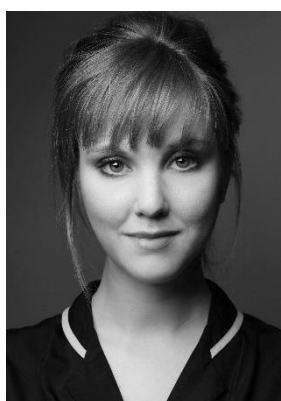
Mélissa Petit