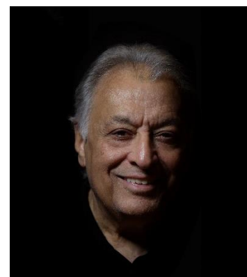
Zubin Mehta