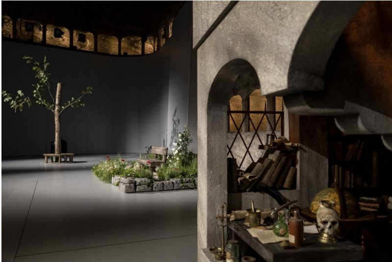
FAUST 2023 – a performative guided tour at the Felsenreitschule