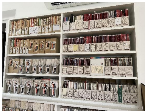
Impressions of the ongoing relocation to the new building