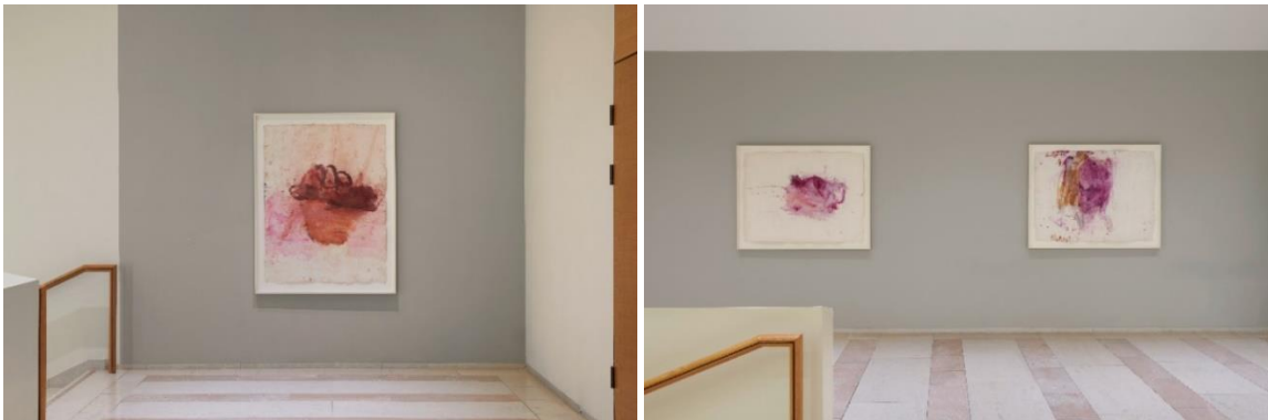
© Martha Jungwirth / Bildrecht, Vienna 2024. Courtesy of Galerie Thaddaeus Ropac, London · Paris · Salzburg · Seoul. Photo: Ulrich Ghezzi.

For the design of the 2024 annual programme , the Salzburg Festival was able to use works by one of the most important artist of our times, Martha Jungwirth . During the Festival period, the Salzburg Festival cooperated with the Galerie Thaddaeus Ropac to show works from the series Odyssey by Martha Jungwirth inside the Festspielhaus foyer.