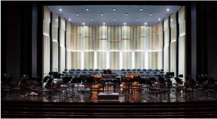
The new concert shell at the Haus für Mozart, planned and built by the Festival's own workshops

The construction of a new concert shell has significantly improved the performance conditions at the Haus für Mozart. Planned and built by the Festival's own workshops, the new "concert room" consists of two side walls, a rear wall and a ceiling and is custom-made for the Haus für Mozart, fulfilling higher acoustic, technical and aesthetic standards.