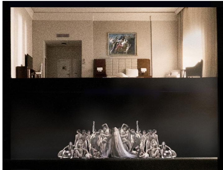
Set design for Hotel Metamorphosis © Michael Levine

Hotel Metamorphosis is a pasticcio for our times.